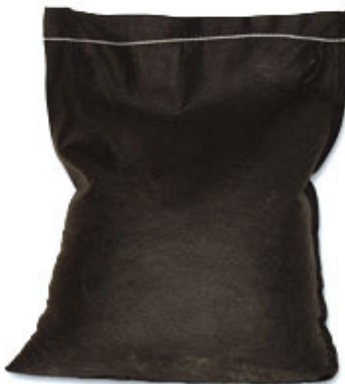
FILLED Gravel Bag pictured.